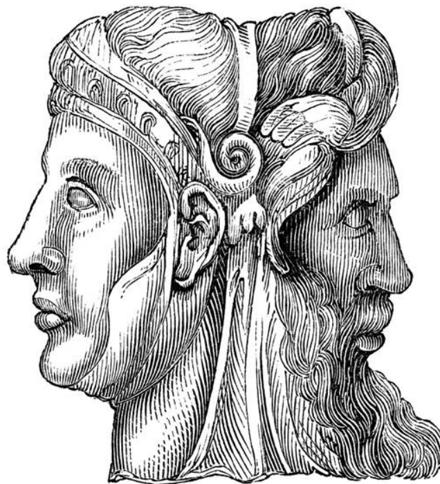
Janus, the Roman god of transitional provisions